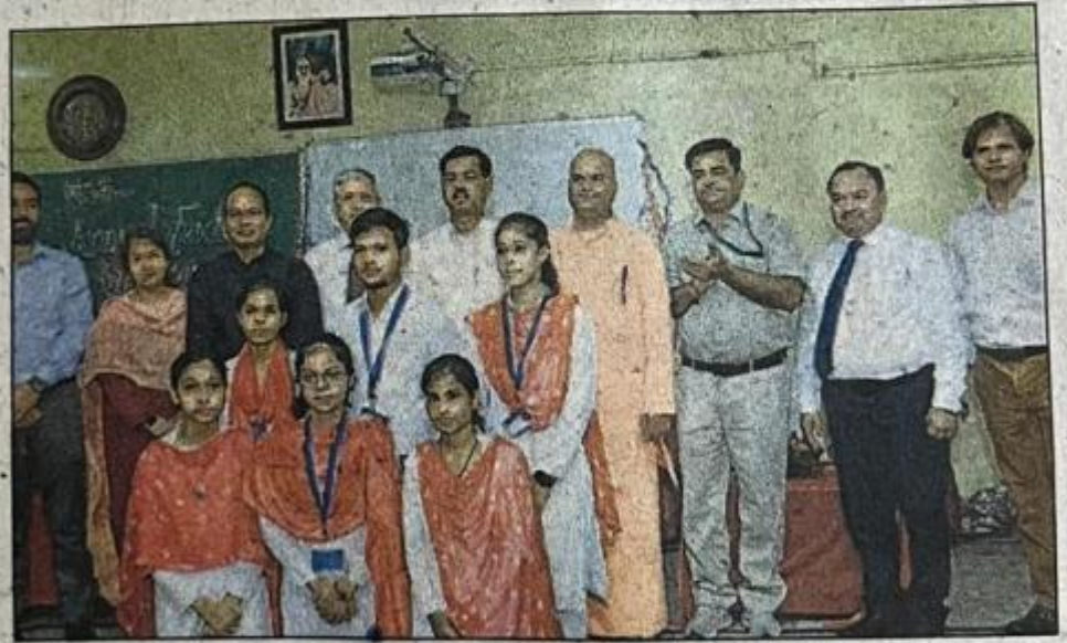
हरिद्वार में शनिवार को चिन्मय डिग्री कॉलेज के वार्षिकोत्सव में मौजूद मुख्य अतिथि।